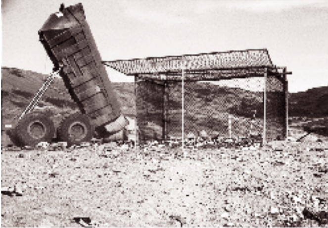
Fig. 1. Top: The trap used to capture Common Ravens at a landfill in West Greenland, 1993-1995. The photo was taken from inside the blind. Bottom: A raven approached and entered the trap minutes after the construction vehicle departed the area.

For oven den benyttede fælde fotografet fra skulet, og for neden en Ravn på vej ind i felden.